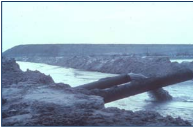
Gypsum Slurry Discharge to Rim Ditch