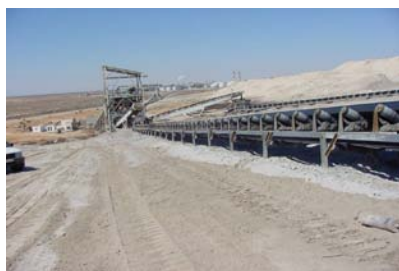
Dry Transport by Conveyor Belts

Dry stacking is thought to be a simpler way of phosphogypsum disposal compared to wet stacking. Even though from one perspective dry stacking is simpler, it does present significant challenges that an operator has to overcome.