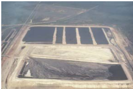
Wet Stack with Single Location Discharge

Wet stacking practice through the mid-seventies in the USA (and current practice in some other countries like Tunisia) consisted of a single point slurry discharge in one of two alternating adjacent compartments, one being actively used for slurry deposition while the other is allowed to dewater and dry-out, and is being prepared by digging gypsum and raising the perimeter dikes. Such a disposal scheme is not efficient because the gypsum in the compartment slopes from the discharge end to the opposite side at a grade ranging from 3 to 8 m per 1000 m depending on the rock source, plant process and slurry solids content. The water