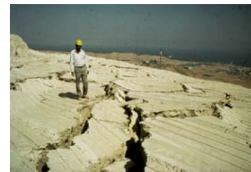
Settlement Cracks in Dry Stack in Valley

The side slopes of a dry stack advancing by avalanches are barely stable, and the gypsum creeps with time, causing the stack to develop large and wide longitudinal cracks that pose a safety hazard to operation personnel. Heavy rainfall events (which occur even in arid climates) may fill open cracks and could then cause a massive sliding failure of the slope of the stack. Therefore, such cracks should be properly backfilled as soon as they are detected.