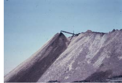
Advancing Face of Dry Stack