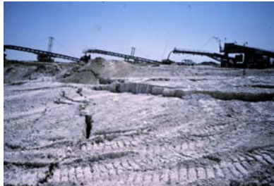
Cracks in Dry Stack on Level Ground

At relatively flat disposal sites (e.g., in Tunisia), the fixed belt conveyor from the plant feeds a series of movable belt conveyors with hoppers (grasshoppers) that are staggered and that feed a stacker which may be a simple short conveyor belt at the discharge end running at high speed to eject the gypsum down the face of the advancing dry stack slope, or alternatively a spreader at the end of the conveyor system. The belt conveyors for a dry stack on flat ground are moved often using a tractor as needed to distribute the gypsum cake uniformly across the wide disposal site area. The gypsum slopes formed by the stacker on flat ground will also be at the angle of repose for loose gypsum, and will have a factor of safety of essentially unity against failure. As with the case of a dry stack in a valley, the stack on flat ground advances via avalanches and develops significant cracks.