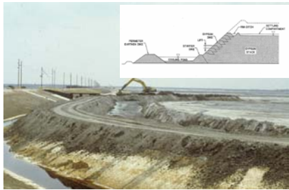
Upstream Method of Construction

ditch, essentially all around the compartment. This is achieved by sequentially breaching the inner dike at progressively more distant locations. Hence, the slurry pipe is maintained at one location and the rim ditch transfers the gypsum to where it is needed in a most efficient manner. In such a sedimentary type deposit, beaches are developed and their extent can be controlled in such a manner to either have a very deep pond (e.g., 10 meters of water depth), or a shallow pond, thus allowing the operator to manage the water inventory on top of the stack using a very flexible and convenient method that optimizes water management (without a need for a high dike at the far end).