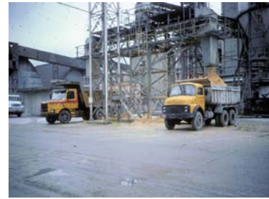
Dry Transport by Trucks

conveyor system to the disposal site. Using trucks to convey the gypsum cake off the filters to the disposal site is usually only feasible for relatively small phosphoric acid plants. For trucking, the dewatered gypsum cake off the filters is transported by a belt conveyor system to a short reversing cross conveyor or a diverter chute at the discharge end of the conveyor. Truck drivers control the changes in direction such that when one truck is full, the driver actuates a control switch which reverses the conveyor to start filling the next truck.