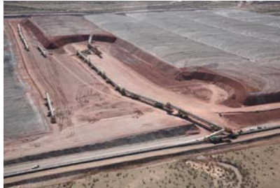
Self-Contained Movable Spreader/Stacker

To limit traffic required to service and move the grasshoppers, which cause dusting problems, and to preclude damage to the bottom liner and drain system, Ma'aden in Saudi Arabia will be using a series of track-mounted, 76-m long self propelled "super portable" conveyors fed through a tripper by two 1 to 2 km long fixed conveyor systems located on each side of the stack. The movable conveyors are set in series, one feeding the other, and they in turn feed a self-propelled track-mounted 55-m long "horizontal conveyor" and a 61 m radial stacker.