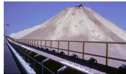
Dry Transport to Stack in Valley

At Aqaba, in Jordan, gypsum is dry stacked in a narrow, deeply incised, unlined valley up to a height of 200 m. A fixed belt conveyor transfers the gypsum cake from the chemical plant, which is located at the low end of the valley, to a ridge at the other end of the valley where a hopper feeds a fixed extendable belt conveyor running along the crest of the gypsum pile. The conveyor in turn feeds a single radial stacker on rails which automatically rotates up to 180° as it senses the build-up of gypsum. As designed, the system is essentially fully automated requiring very little support equipment and personnel. Unfortunately as the stacker advanced on the deposited gypsum, the self-weight settlement of the previously deposited gypsum became too large (up to 1 m per day) for the stacker to maintain its vertical alignment. Therefore, the advance of the stacker along the valley had to be slowed down by having to keep adding material under the conveyor belt and stacker sleepers, and by laterally feeding grasshoppers on both sides to spread the gypsum more broadly across the valley. Such a disposal scheme advances via gypsum avalanches and sliding/sloughing which may not be feasible at other sites.