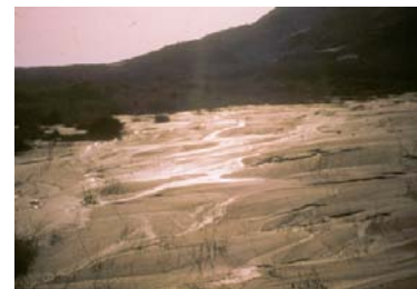
Seepage from Base of Dry Stack

Experience with dry stacking indicates that the lower portion of a dry stack will be saturated even in a desert or arid climate due to gypsum self-weight consolidation and settlement. Hence, even without rain infiltration, the lower portions of dry stacks become saturated with time. This occurs to some extent in all dry stacks, even where the gypsum cake is well filtered, i.e., at a moisture content less than 25%. Since significant seepage can be expected at the base of the stack even if dry stacking is used, one of the previously perceived advantages of dry stacking is no longer justified because a liner is required in either case to control seepage of entrained process water from the stack. Note that for a dry stack advancing via avalanches, it is almost impossible to a liner or underdrains because they will be destroyed by the sloughing gypsum slopes.