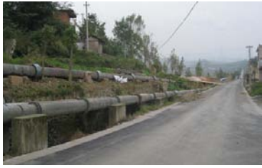
High Pressure Gypsum Slurry Pipelines

maintenance. In most situations on private property, e.g., in Florida where the mine and chemical plant properties often abut each other, the HDPE pipelines are simply laid on the ground. In special cases, the black HDPE is painted white to control contraction and expansion by reducing heating from exposure to the sun, thus limiting lateral movement and “snaking” of the line. High pressure steel pipes lined with either rubber or HDPE are used on occasion to allow for high pumping pressures over long distances or to great heights without the need for booster pumps.