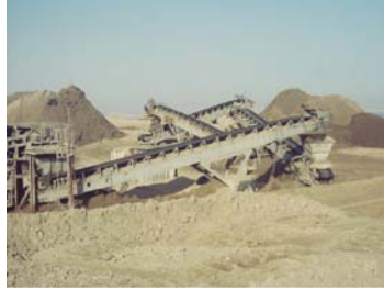
Dry Stacking Using Grass Hoppers