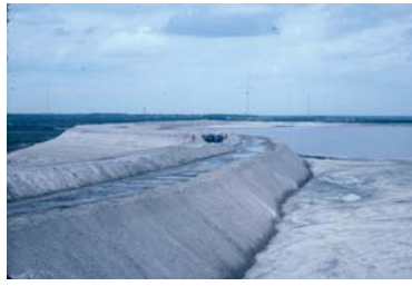
Elevated Sloping Rim Ditch