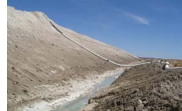
HDPE Slurry Line to Stack Top

At the disposal site, the pipelines are laid up the relatively steep side slope of the stack as needed to direct the slurry flow into one of the settling compartments atop the stack. Because of the need to occasionally flush and clean the line after a power failure, it is good practice to include flanges within the slurry line at a low point near the toe of slope. Gypsum sediment that settles in the line and accumulates at the low point could then be cleaned if needed by quickly opening and re-bolting the flange connection without having to cut and re-weld the line. Flanges are also convenient to include along the slope as pipe sections could easily be added (at say 5-meter height intervals) as the stack is raised.