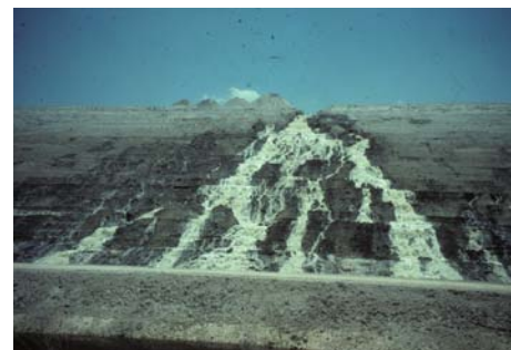
Process Water Decantation through Cut

convenient, safe and inexpensive method practiced at many wet stacks in Central Florida. In this method, a cut is made through the gypsum dike and process water is simply allowed to flow down the slope of the stack. Such a decant method is feasible with gypsum saturated water high in fluorosilicates that precipitate on the slope of the stack forming an erosion resistant hard crust that resists erosion in spite of the turbulent flow. (Such a decant method is not feasible for use with earthen materials which would be highly susceptible to erosion.) Care must be exercised when properly filling the cut made through the gypsum dike.