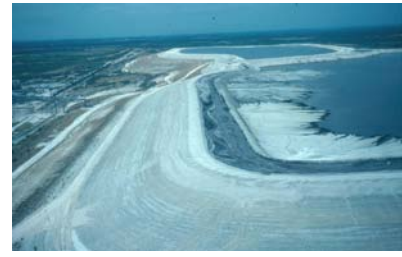
Beaches Formed from Rim Ditch Cuts

ditch, essentially all around the compartment. This is achieved by sequentially breaching the inner dike at progressively more distant locations. Hence, the slurry pipe is maintained at one location and the rim ditch transfers the gypsum to where it is needed in a most efficient manner. In such a sedimentary type deposit, beaches are developed and their extent can be controlled in such a manner to either have a very deep pond (e.g., 10 meters of water depth), or a shallow pond, thus allowing the operator to manage the water inventory on top of the stack using a very flexible and convenient method that optimizes water management (without a need for a high dike at the far end).