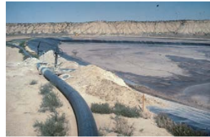
Gypsum Slurry Deposition Using Spigots

is used in some countries with cheap labor is very labor intensive and requires continuously moving the pipeline upslope as the stack is being raised. More sophisticated ways of spigoting would include T's with flanges and knife valves that can be used to control the flow along the slurry line and into the compartment (without a need for breaking the line each time). Such a system is suitable for use if the gypsum stack is located in a valley where only one wall is being raised (with other sides abutting the mountain), so the pipe does not need to be frequently moved upslope. The spigot system functions like a rim ditch, but is more labor intensive. The crest of the stack can be maintained level if the spigoting method is used which may be an advantage for stacks founded on very soft ground where stability and strength gain over time are important considerations.