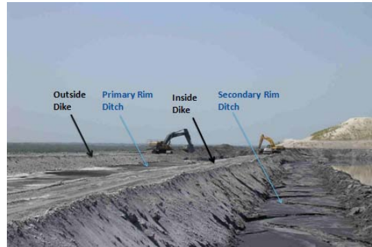
Equipment Accessible Inner & Outer Dikes

The transition to hydraulic excavators required incorporating a trafficable inner dike or berm (with a much wider crest than the windrow), and even though the quantity of material needed for dike construction increased with use of the wider inner dike, construction proceeded at a faster pace using hydraulic excavators, a method preferred by operators or contractors charged with managing and raising the wet stacks. A second rim ditch inboard of the inner dike may be added for convenience and to improve efficiency if needed. Moist gypsum excavated from a rim ditch above the water table is an ideal construction material which can be simply placed on the dike crest and inner berm, quickly tamped with the backhoe bucket or rolled and shaped with a tracked dozer. Construction proceeds in this manner even while the inner compartment is full of water.